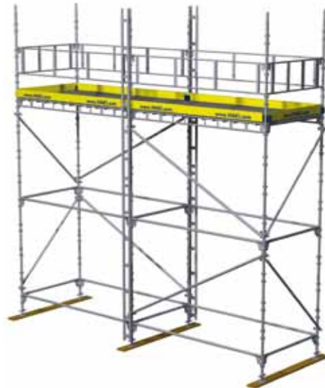
The HAKI Tripod for large standard loads in loading towers

The HAKI Tripod is designed for really demanding jobs. It copes with extremely heavy loads and can be used as a track for the HAKITEC weather protector or as a beam. Fully compatible with the HAKI Universal and as horizontals and diagonals, it uses standard HAKI Universal components. Start with the HAKI Tripod as an upright and finish with a standard FSSH when the load has decreased.