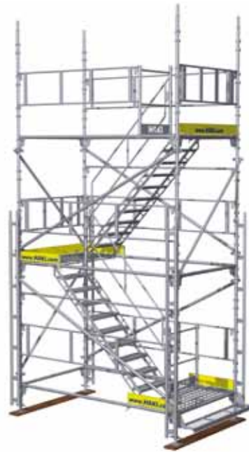
The HAKI Tripod for large standard loads in tall stair towers