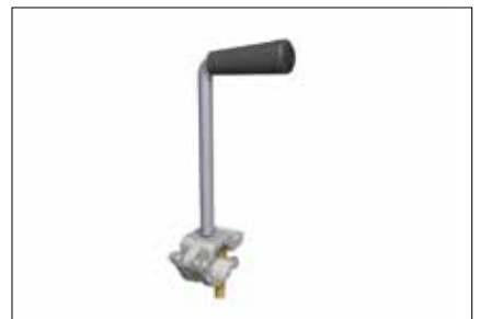
7164002 Crank with coupler 1,6 kg