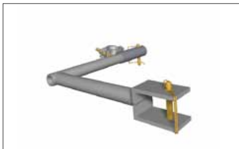
7541009 Bracket sheet mounting 3,3 kg