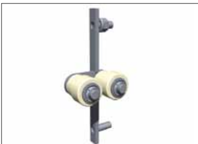
7541005 Guide Trak sheet 1,1 kg