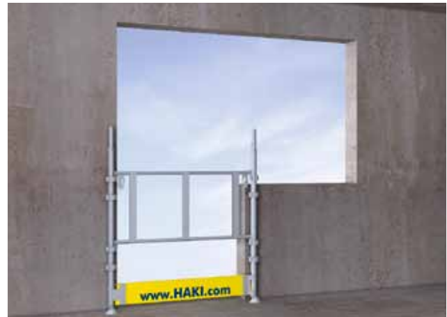
Slab with screw base joints, standards, guardrail frame and toeboard.