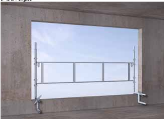
Windowback with multiple clamps, standards and guardrail frame.