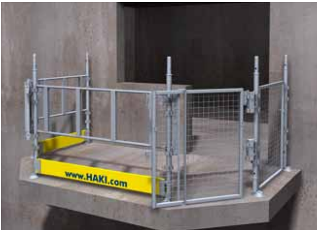
The SGF gate bracket allows you to place guardrail posts where you want when using safety gates with netting. The combination fitting allows installation at different angles.

HAKI Safety is a robust fall protection system that meets the requirements of EN 13374 Class A. The system can be easily adapted to different needs.