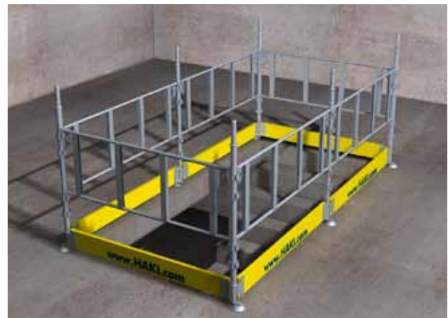
Screw base joints with standards, guardrail frames and toeboards.