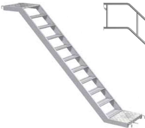
Stair UTV 3050x2000 4102302 (29.2 kg)

The convenient 44° angle of inclination offers optimum user comfort and efficient site working.