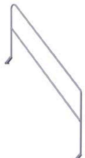
Handrail inner UTV AL 7058253 (11.4 kg)