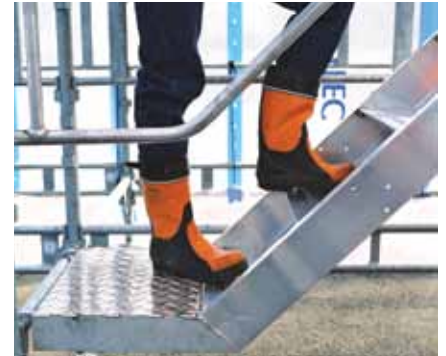
HAKI Slim Stair with handrail in aluminium

The HAKI Slim Stair replaces the ladder inside a scaffold for a safer solution.